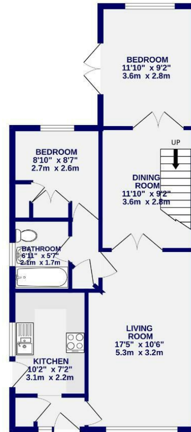
GROUND FLOOR 625 sq.ft. (58.0 sq.m.) approx.